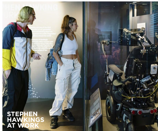
STEPHEN HAWKINGS AT WORK